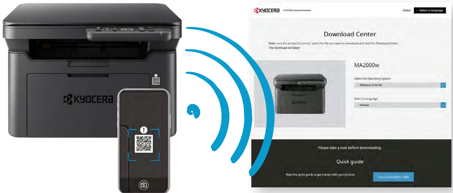
Web page - Global Download Center

Our Kyocera online download center, accessible 24/7, provides support videos for product setups, drivers installations and access to our free Client Tool utility. For easy access to the website, you can simply scan the QR code that is on the front of the printer from any smartphone or tablet.